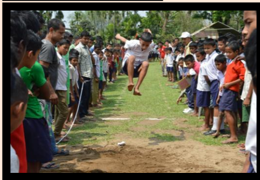
Last Issue PhotoSpeak