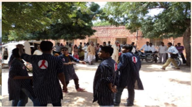
Street Play for general awareness