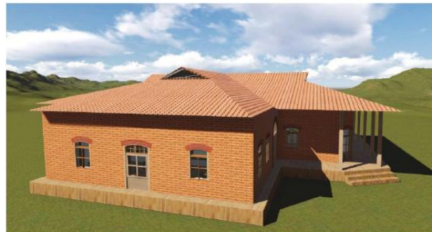
Proposed front facade