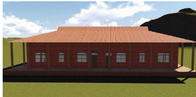
Proposed Rear facade