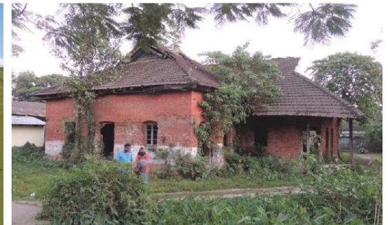
Existing front facade