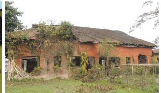
Existing Rear facade