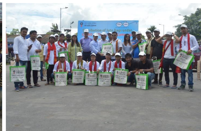
Distribution of Jute bags