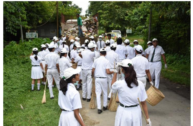
Cleanliness Drive in Schools