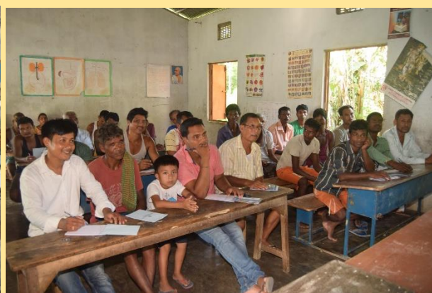
Sali Crop Training Program under OIRDS Agriculture Project in OIL's operational areas