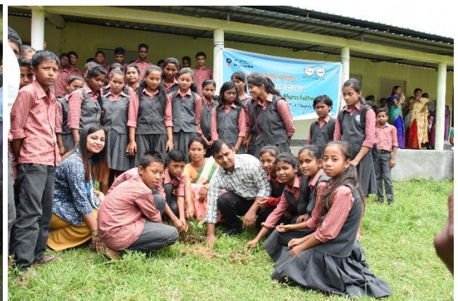
Tree Plantation in Schools