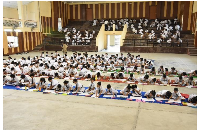
Drawing Competition in Schools