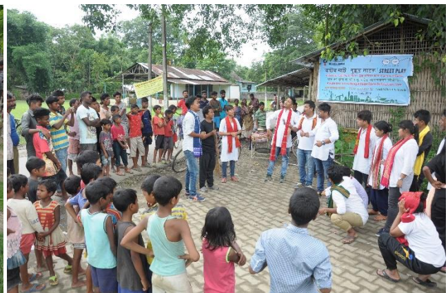
Street Play on Open Defecation in Villages