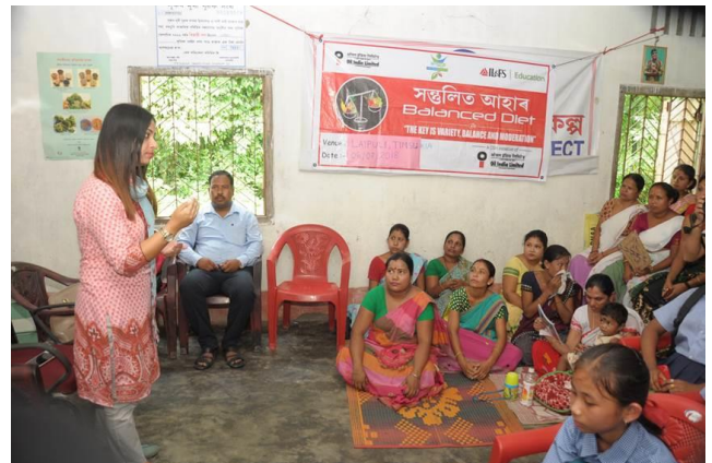
Health Talk in Schools