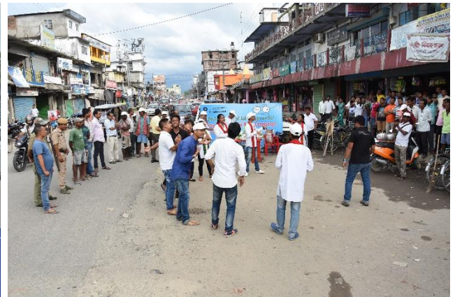
Street Play on Swachh Bharat at market Places