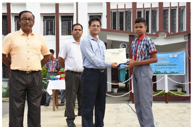
Giving away certificate to the winners of Drawing Competition