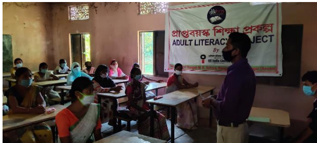
Adult Education classes under OIL Dikhya started maintaining COVID protocols under Project Dikhya