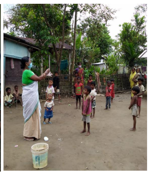
Inauguration & discussion on Poshan abhiyaan month and measurement of height & weight among pregnant women, Lactating mothers, infant, child under Project Arogya