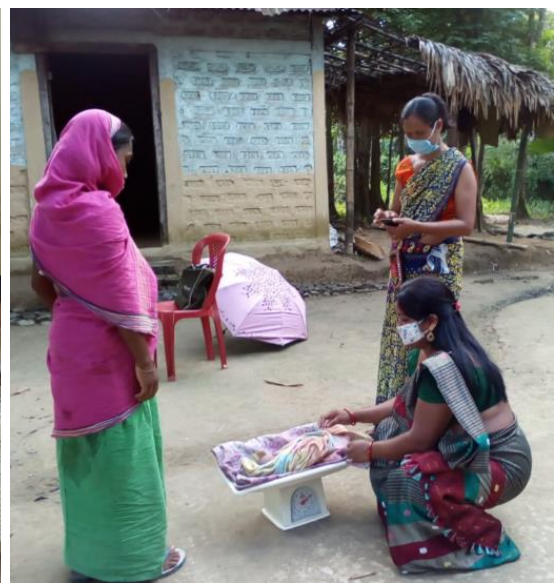
Measuring weight - height & MCP card discussion during ANC and PNC visit tracking under Project Arogya