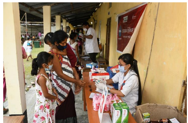
Sparsha OIL's mobile dispensary organized at the relief camps at Baghjan