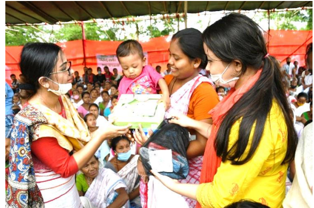
Distribution of Hygiene Kits at Baghjan under Project Arogya