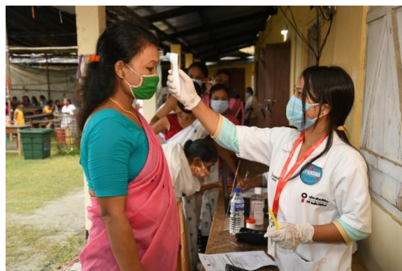
Doctors & Nurses under OIL Sparsha project organizing health check-up & dispensing medicine at the relief camps in Baghjan.