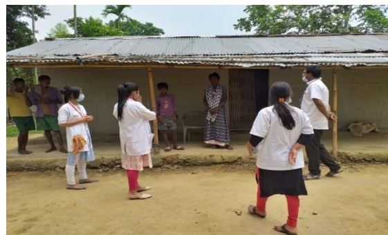
Doctors & Nurses conducting Home Visit to provide home based health check up & medicine dispensing in designated villages at OIL SPARSHA Mobile Dispensary Camp