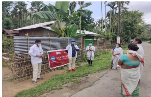
Doctors & Nurses conducting awareness on COVID-19 in a village at OIL SPARSHA Mobile Dispensary Camp